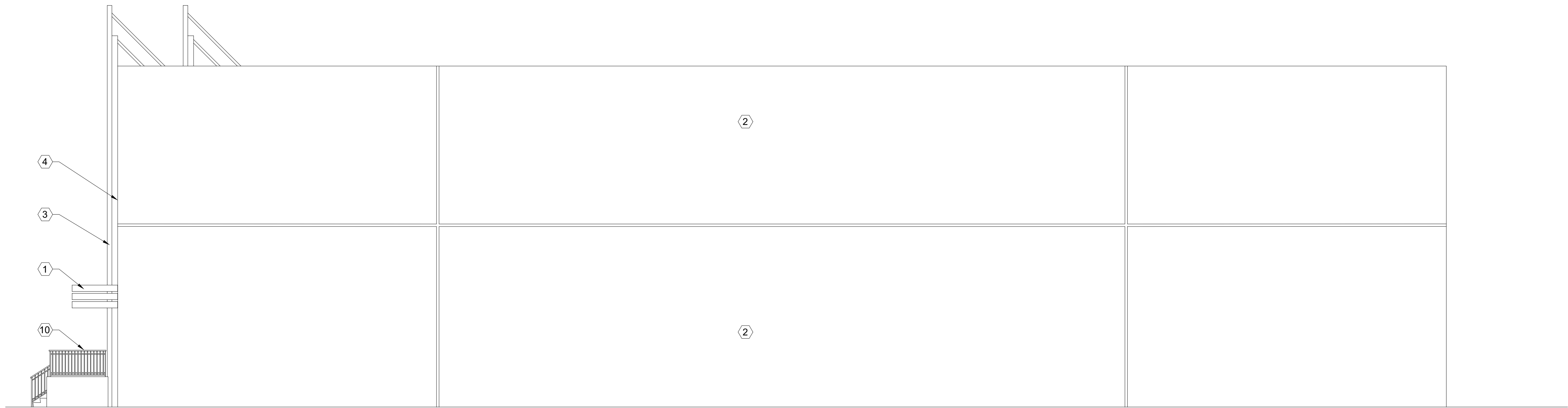
04 NORTH BUILDING ELEVATION SCALE: 1/8" = 1'-0"