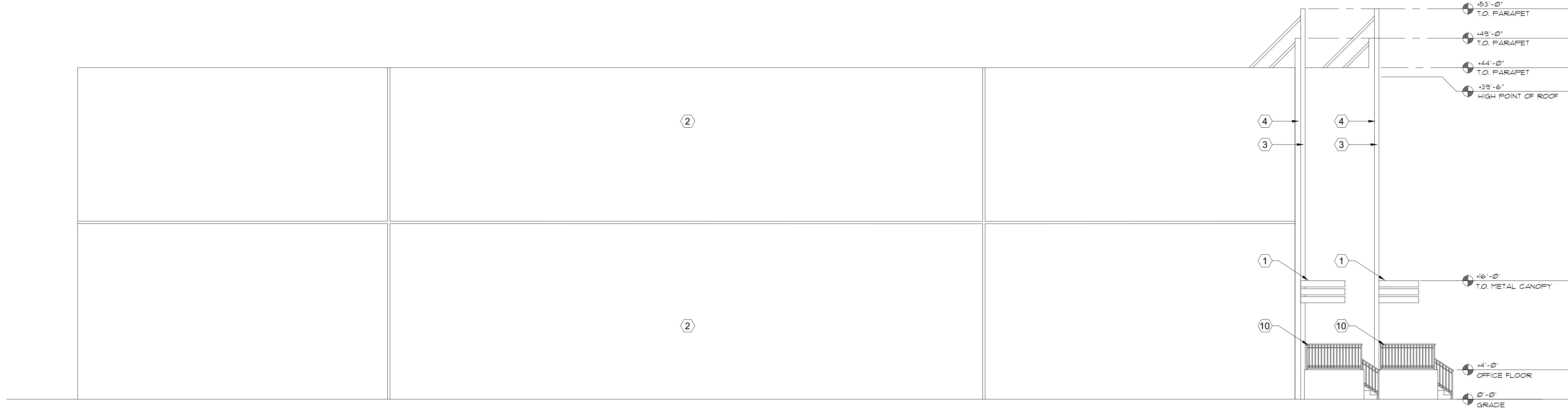
03 SOUTH BUILDING ELEVATION SCALE: 1/8" = 1'-0"